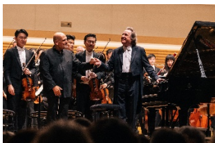
Jaap van Zweden (left) and Rudolf Buchbinder