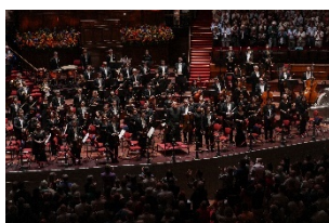
Jaap van Zweden and the HK Phil