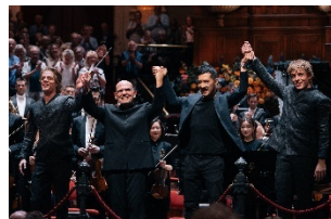
(From left) Arthur Jussen, Jaap van Zweden, Joey Roukens, Lucas Jussen