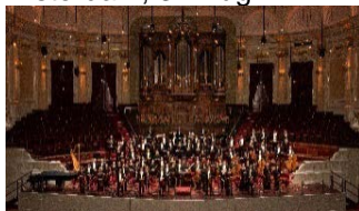
The HK Phil