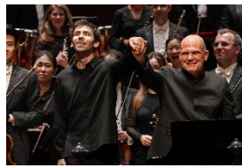
Alexandre Kantorow (left) and Jaap van Zweden