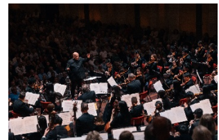
Jaap van Zweden and the HK Phil