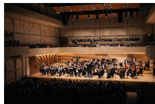
Jaap van Zweden and the HK Phil