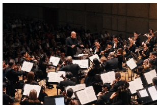
Jaap van Zweden and the HK Phil