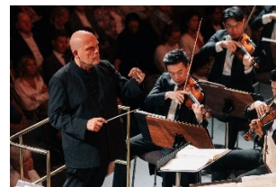
Jaap van Zweden and the HK Phil