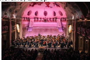
Jaap van Zweden and the HK Phil