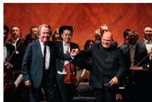
Rudolf Buchbinder (left) and Jaap van Zweden