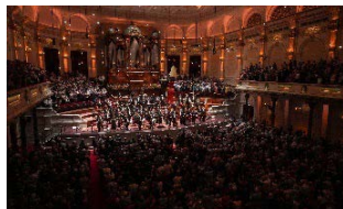
Standing ovation at Het Concertgebouw